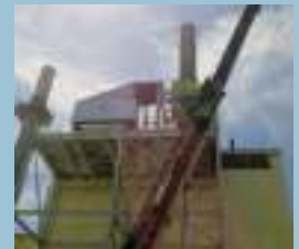
Application in the chemical industry