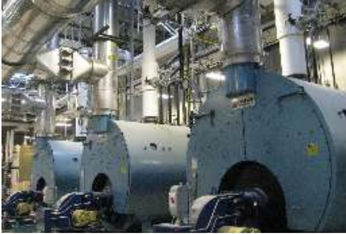
Application in food production

gases. The Indirect Condensing Economizer will heat a cold input process water stream that is currently consuming live energy (steam, hot water, electricity, etc.) to heat, and transfer this currently wasted energy from the exhaust gas to back into your process. The condensing economiser transfers enough energy to cool the flue gas below the water vapour dew point, recovering the latent heat and creating a viable water source.